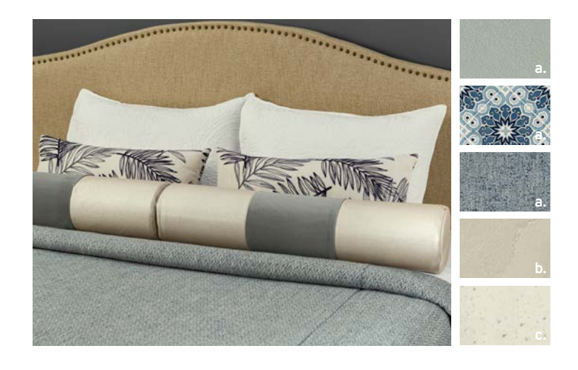
REMMY INTERIOR a. Furniture/Fabric b. Flooring c. Counter Top