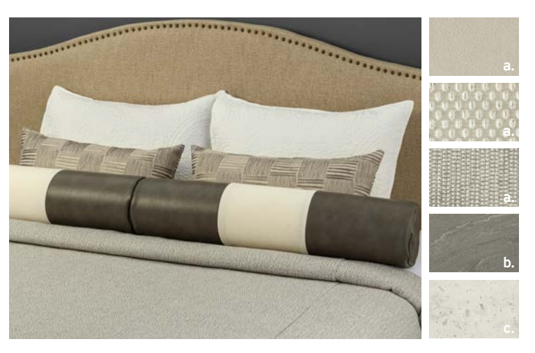
SPARTA INTERIOR a. Furniture/Fabric b. Flooring c. Counter Top