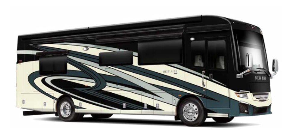
REMMY EXTERIOR Awning Color: Charcoal Tweed