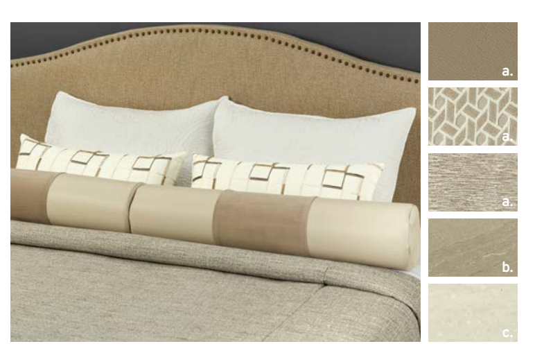
KINGSLEY INTERIOR a. Furniture/Fabric b. Flooring c. Counter Top