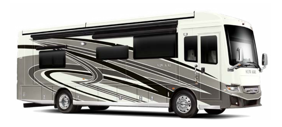
KINGSLEY EXTERIOR Awning Color: Charcoal Tweed