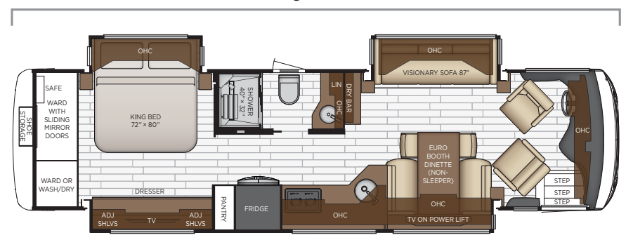
Length: 35' 10"