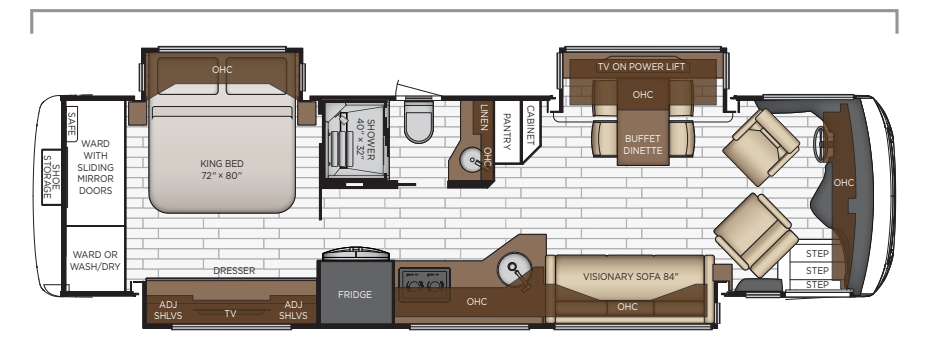
Length: 35' 10"