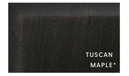
*Available in High Gloss or Suede Finish