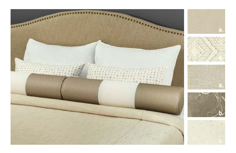
BERKLEY INTERIOR a. Furniture/Fabric b. Flooring c. Counter Top