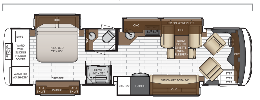
Length: 35' 10"