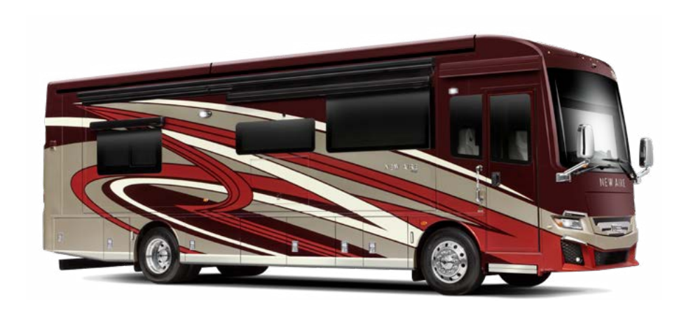
BERKLEY EXTERIOR Awning Color: Linen Tweed