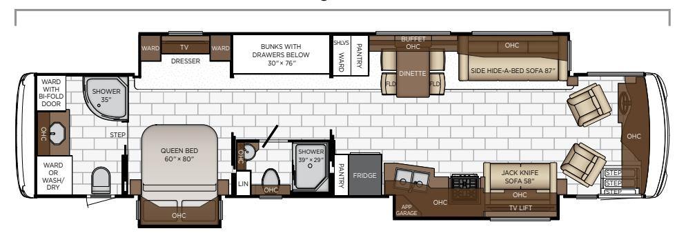
Length: 43' 10"