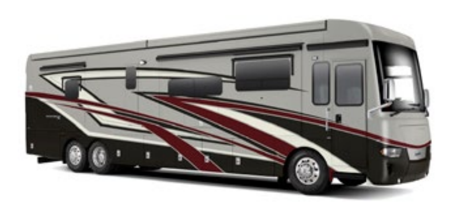
BELMONT EXTERIOR Awning Color: Charcoal Tweed