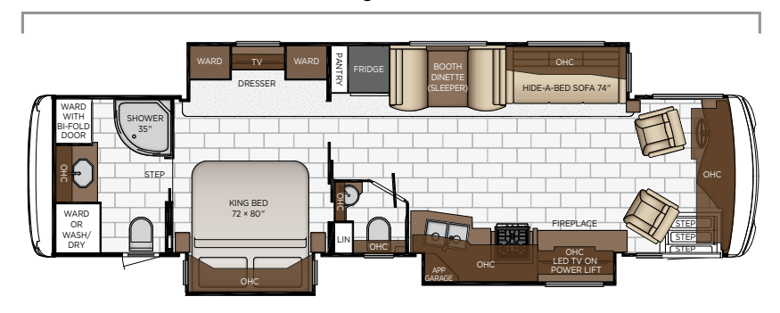
Length: 37' 10"