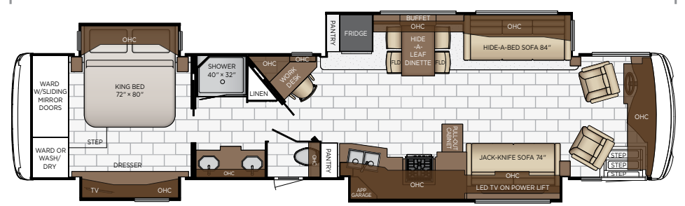
l' 10" Length: 43' 10"