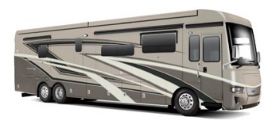
GOTHAM EXTERIOR Awning Color: Linen Tweed