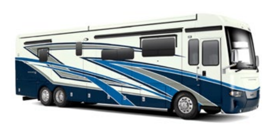
COLFAX EXTERIOR Awning Color: Charcoal Tweed