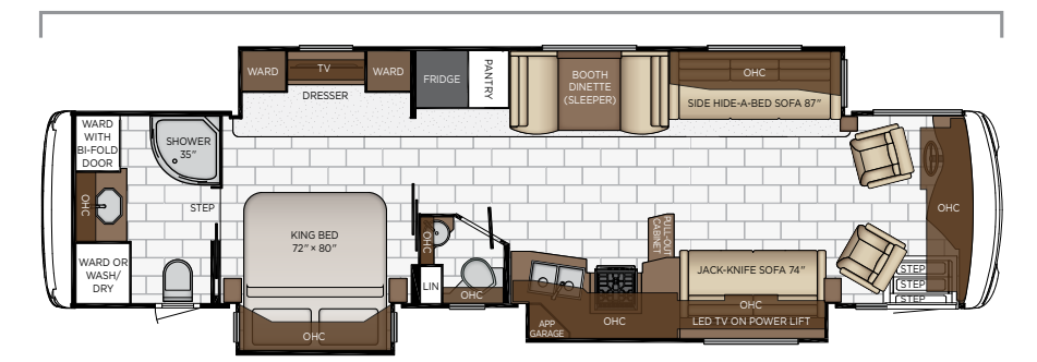
Length: 40' 10"