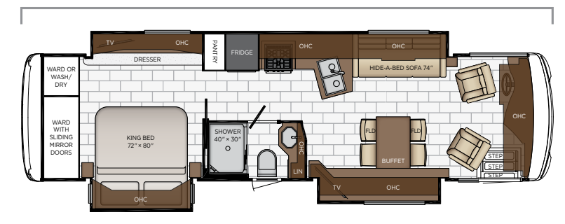
Length: 34' 10"