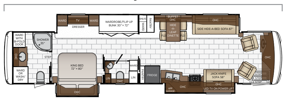
Length: 43' 10"