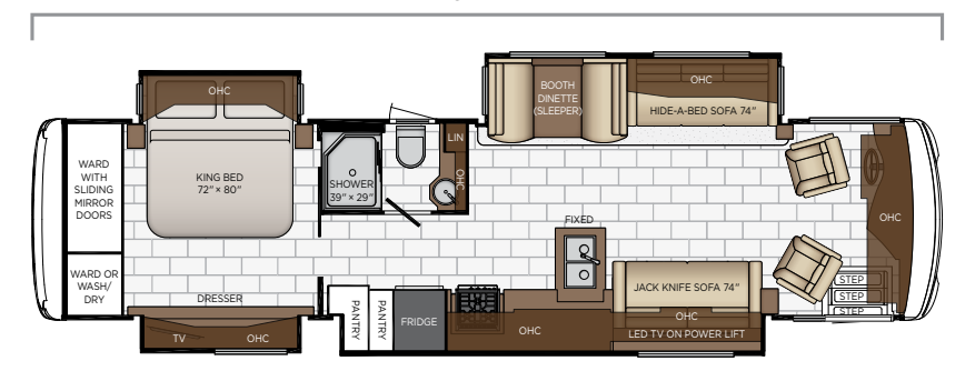
Length: 37' 10"