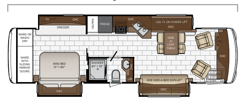
Length: 34' 10"