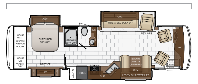
Length: 34' 10"