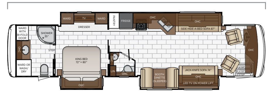
Length: 40' 10"