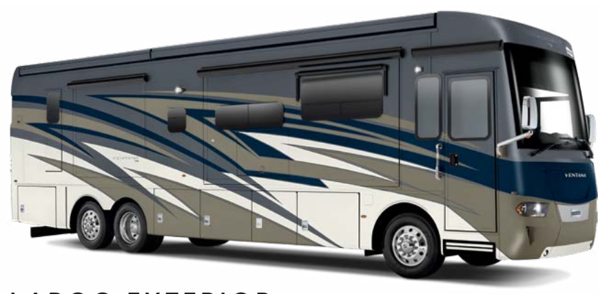
LARGO EXTERIOR Awning Color: Charcoal Tweed

CHATEAU EXTERIOR Awning Color: Charcoal Tweed