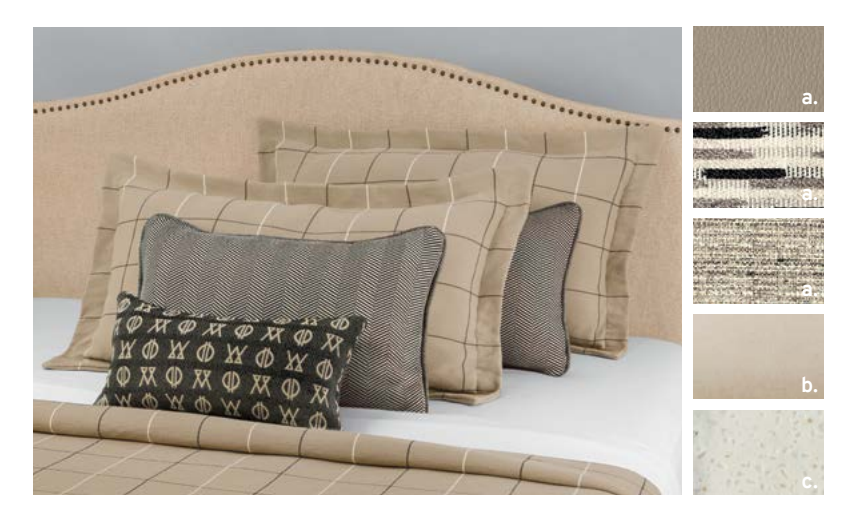
BELMONT INTERIOR a. Furniture/Fabric b. Flooring c. Counter Top