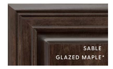
*Available in High Gloss or Matte Finish