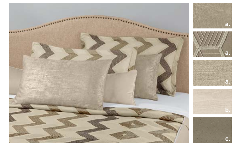
HAMDEN INTERIOR a. Furniture/Fabric b. Flooring c. Counter Top