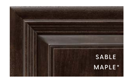
*Available in High Gloss or Matte Finish