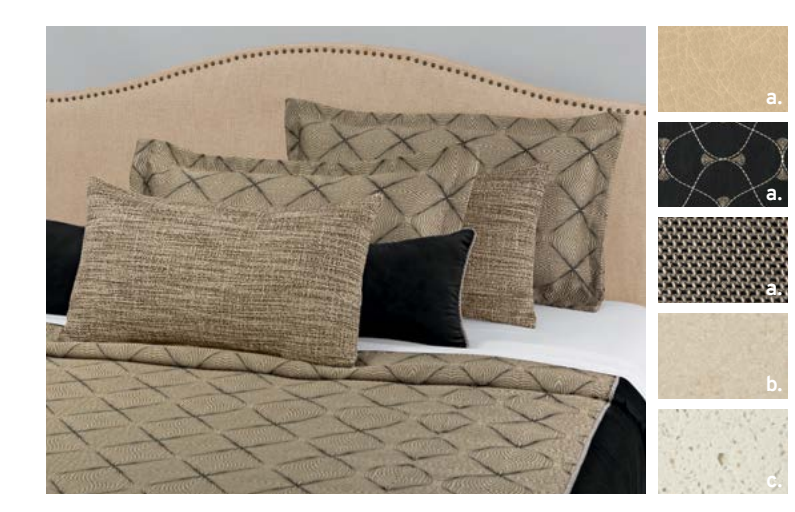
ARTISAN INTERIOR a. Furniture/Fabric b. Flooring c. Counter Top