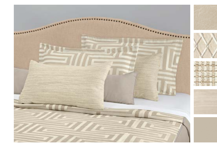
IBIS INTERIOR a. Furniture/Fabric b. Flooring c. Counter Top