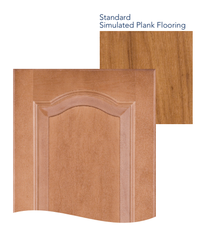
Ginger Maple with Glazed Doors