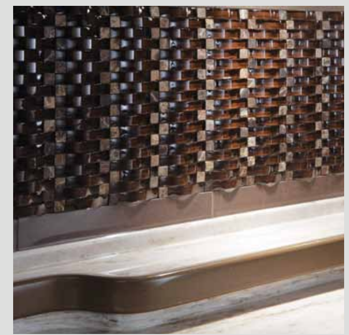
TYLISH BASKET WEAVE BACKSPLASH

Let there be no mistake about it. This is the kitchen you will both want to spend time in. Including artfully designed hand rubbed hardwood cabinets with a softly rounded profile, a glowing designer backsplash and residential stainless appliances to finish it all off.