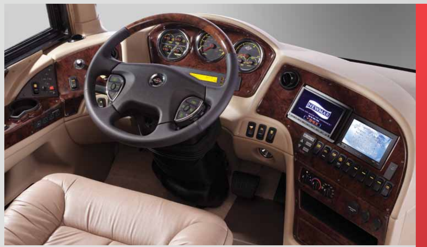
COMFORT DRIVE™ EQUIPPED