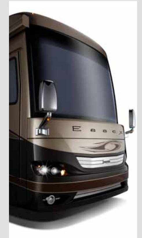
NEW FRONT GRILL