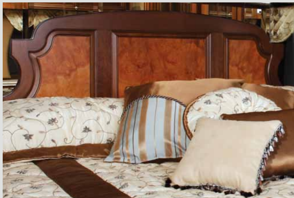
RLED WOOD HEADBOARD