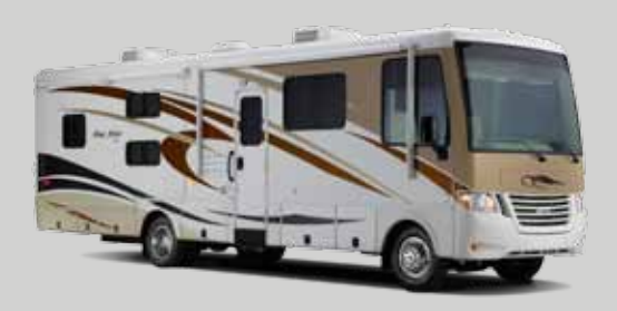
Nottingham with optional paint