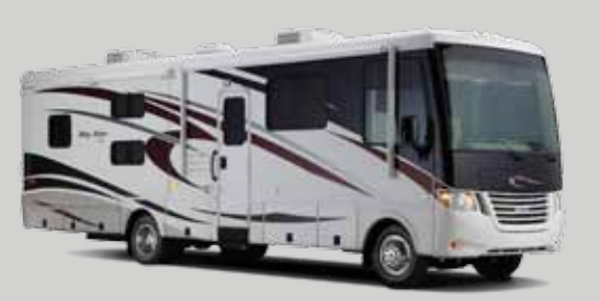
Sherwood with optional paint