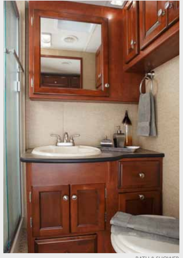
BATH & SHOWER

Your Bay Star Sport's bathroom feels like home, from its privacy glass shower door to the warmth of its Monteray Maple* radius lavatory cabinet. This definitely feels like a Newmar!